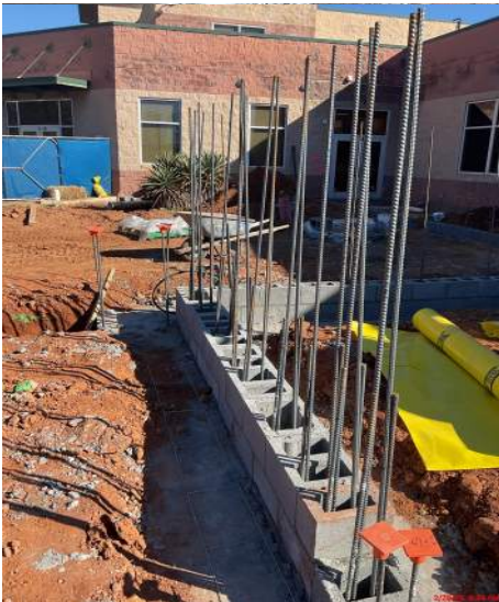
Installing CMU foundation wall