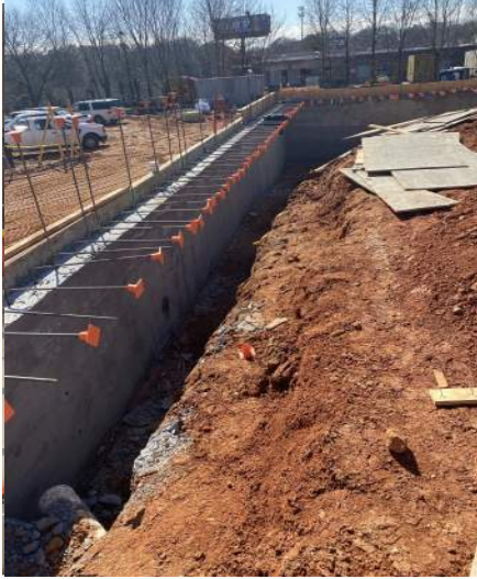
Foundation wall complete