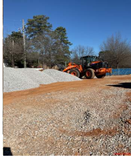
Backfilling in progress